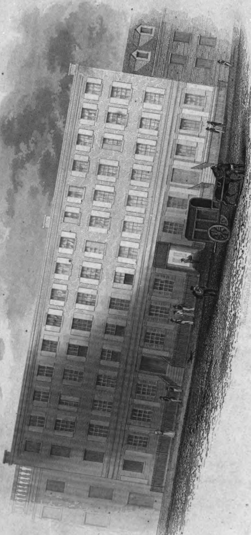
THE METHODIST BOOK CONCERN 200 Mulberry Street N.Y.